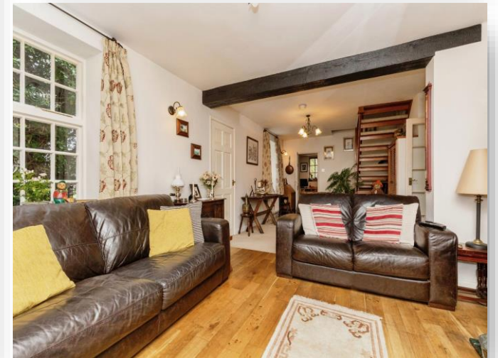
Westwells, Neston Corsham SN13 9RJ