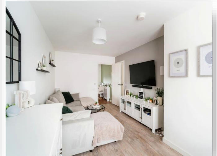
St. Philip Street, Corsham SN13 0FS