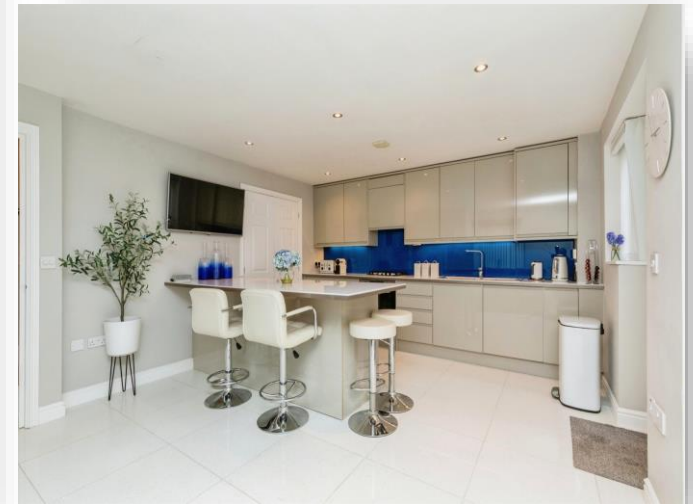
Lewis Close, Corsham SN13 9EA