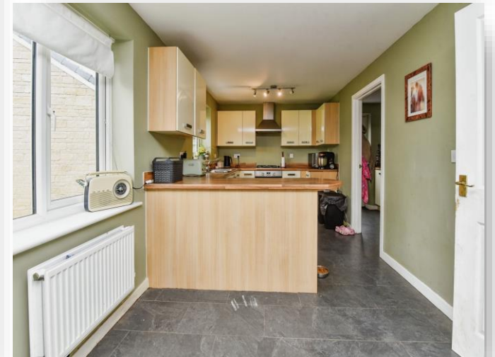
Teachers Way, Melksham SN12 8FA