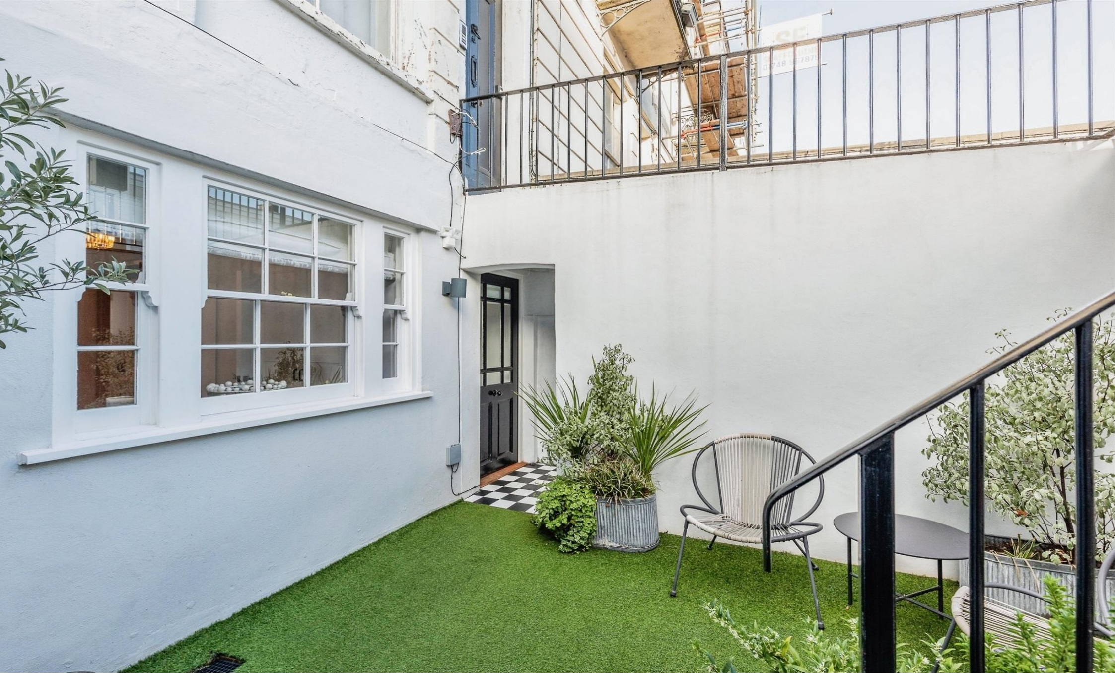
Flat 1 St. Pauls Road, Clifton Bristol BS8 1LR