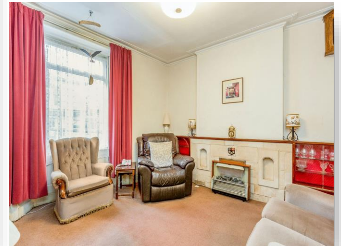
Clifton Wood Crescent, Clifton Wood Bristol BS8 4TU