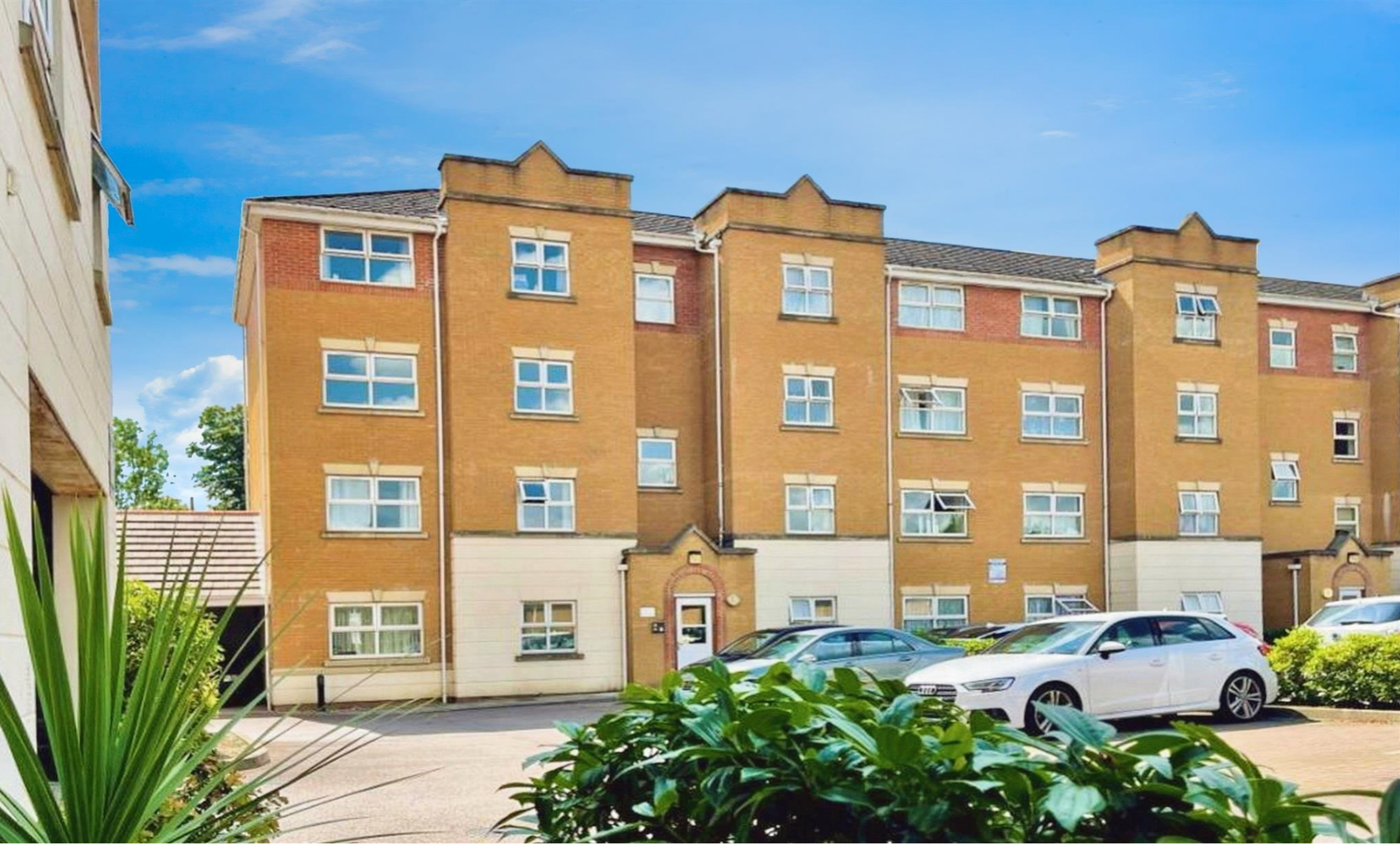
Pickfords Gardens, Slough SL1 3GF