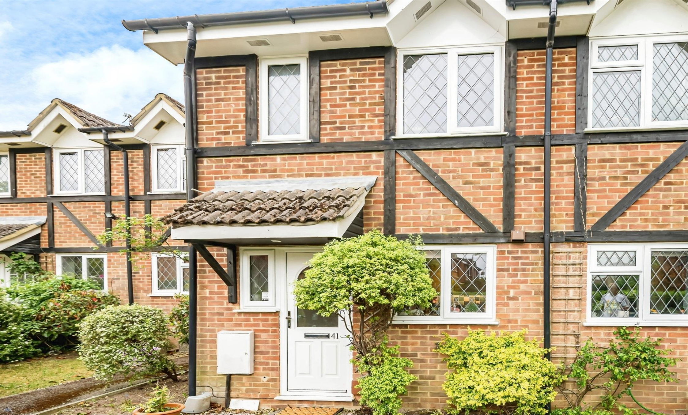
Old Fives Court, Burnham Village, Bucks SL1 7ET