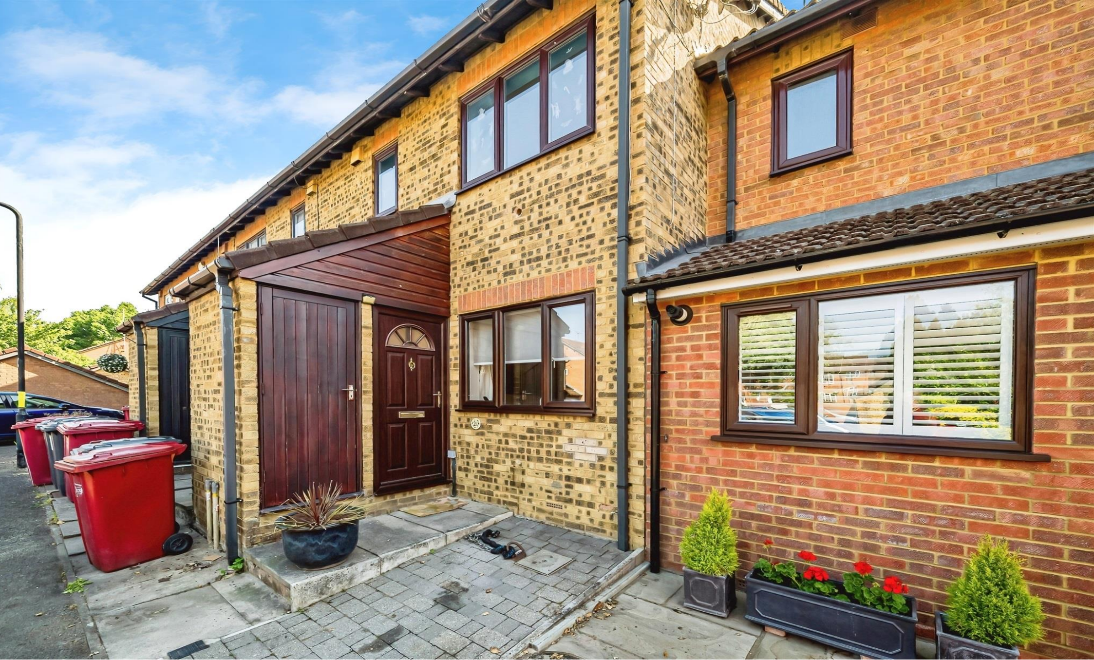
Charlton Close, Slough SL1 9HD