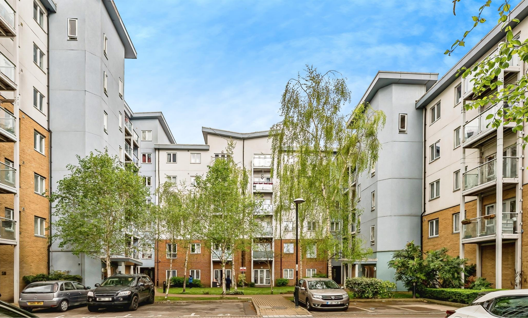
Foundry Court Mill Street, Slough SL2 5FY