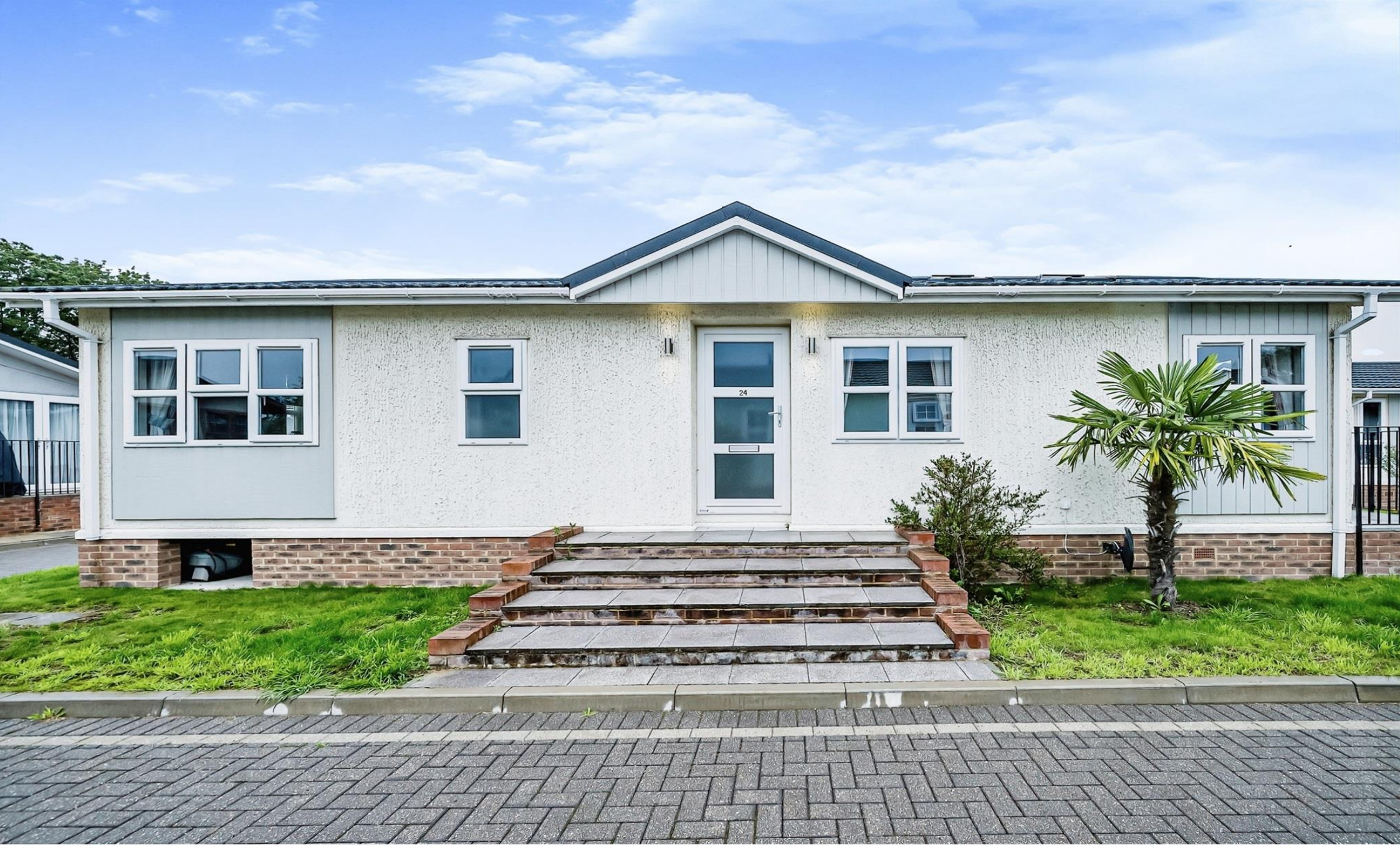
Huxtable Gardens Lyngfield Park, Maidenhead SL6 2DS