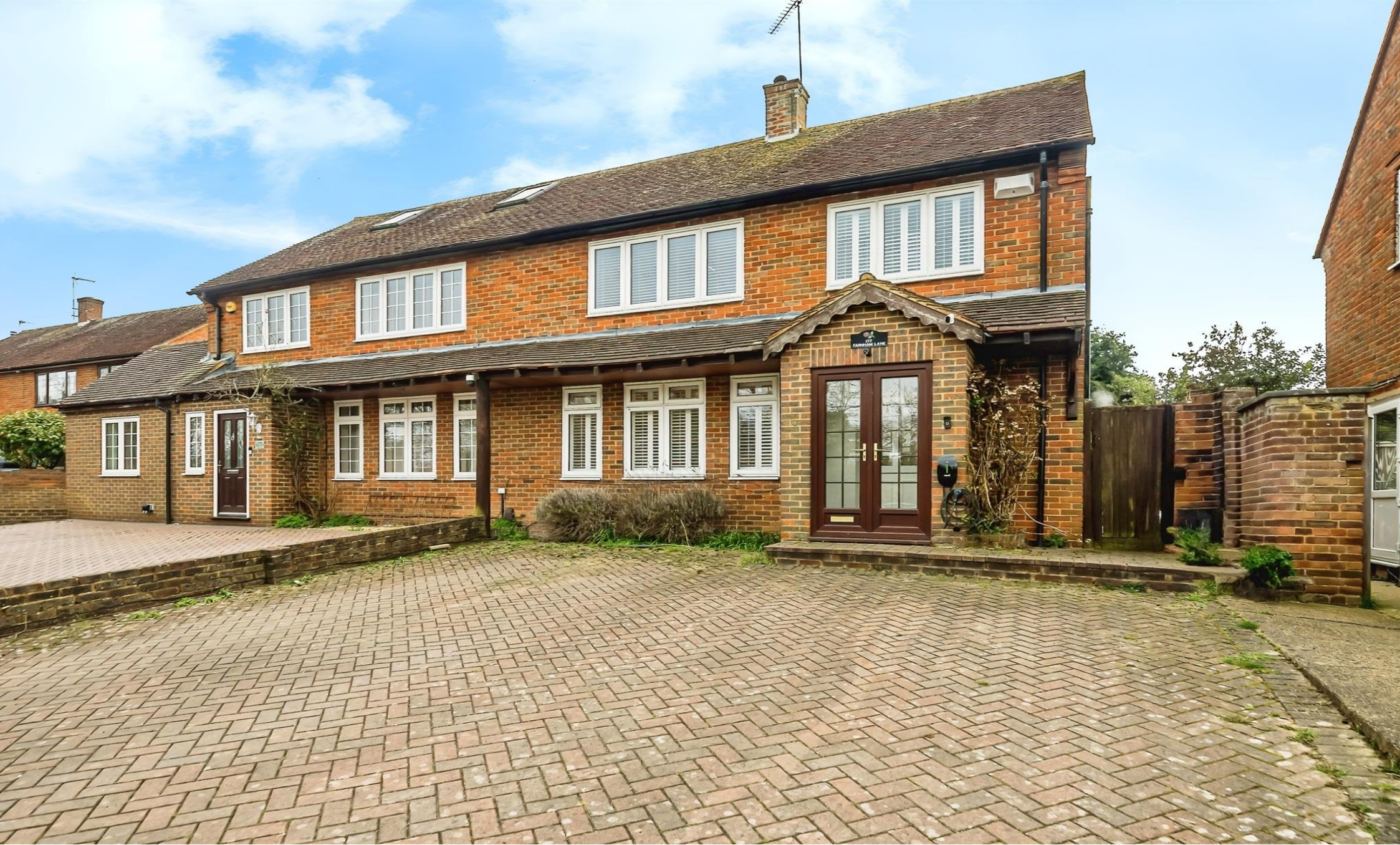
Farnham Lane, Slough SL2 2EW