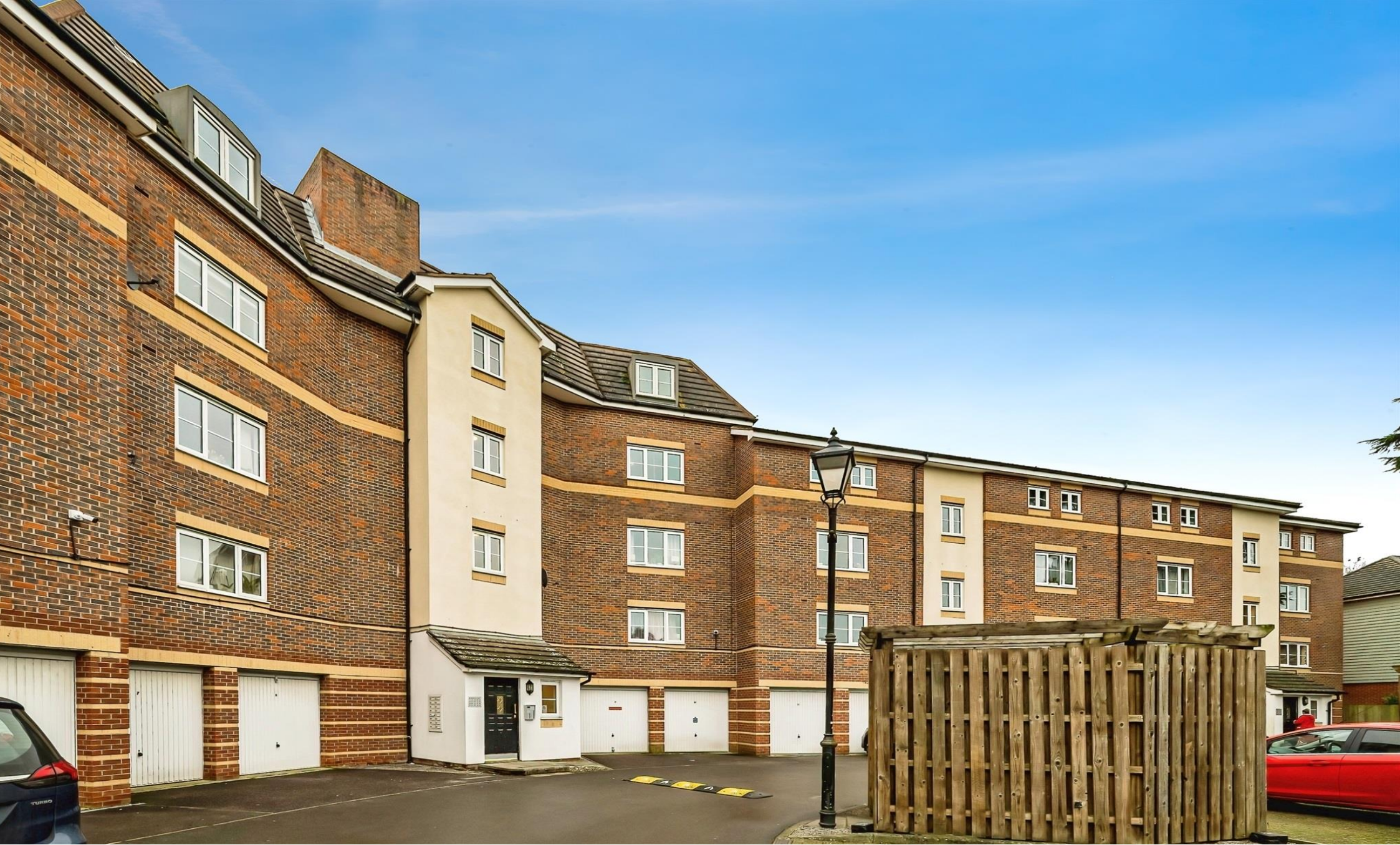
Bosworth Court Bath Road, Slough SL1 6DA