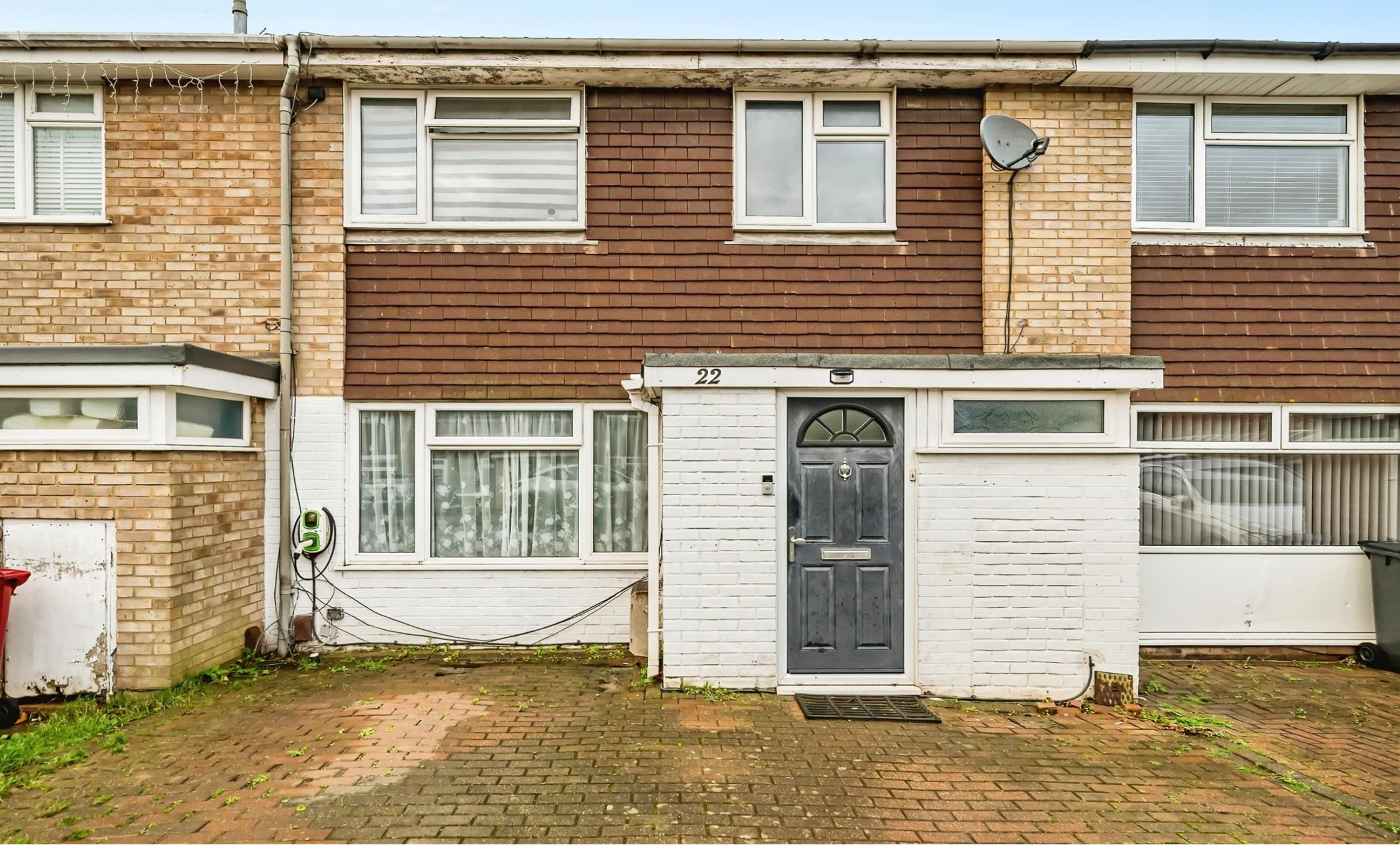
Birch Grove, Slough SL2 1EP