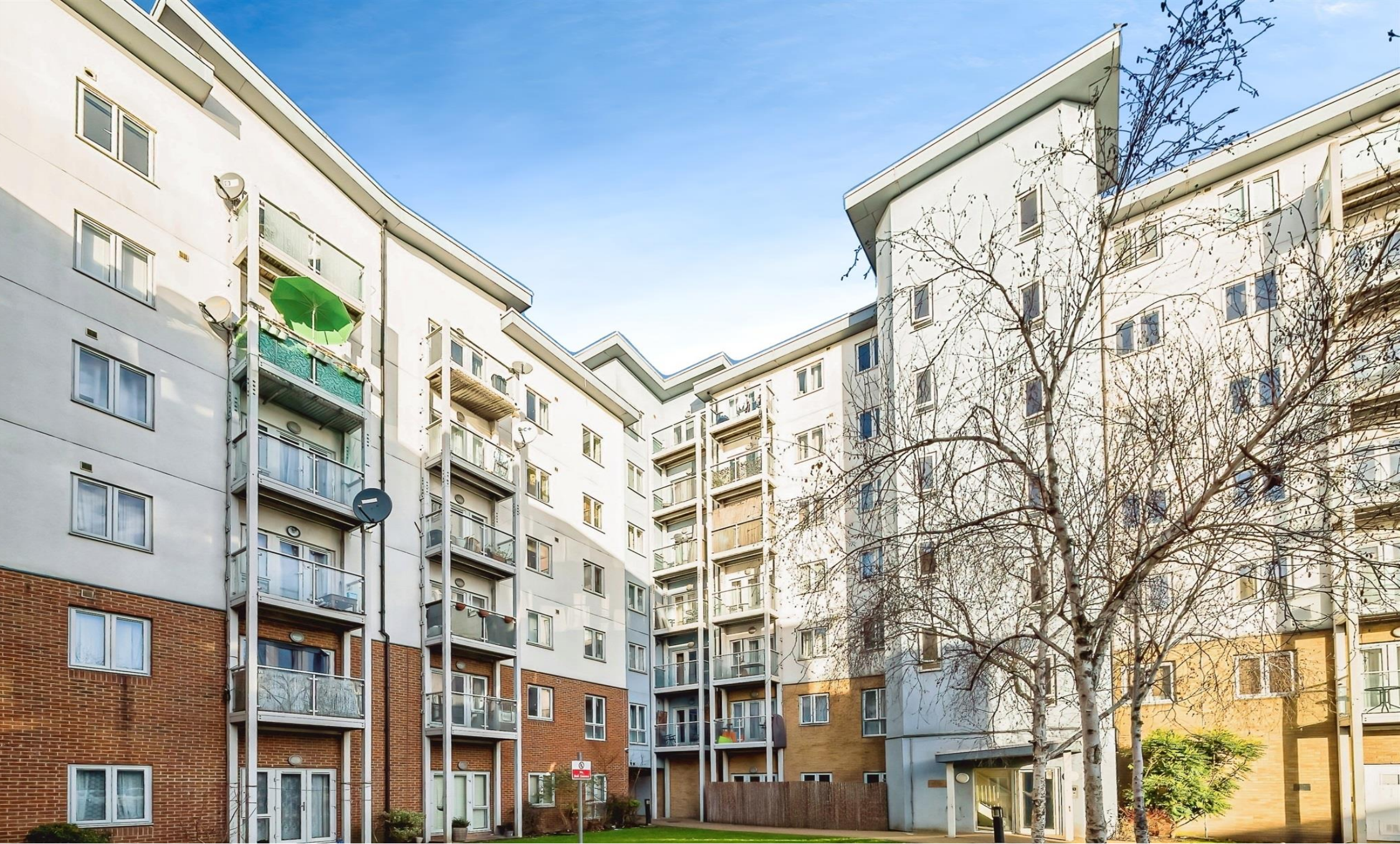
Foundry Court Mill Street, Slough SL2 5FY