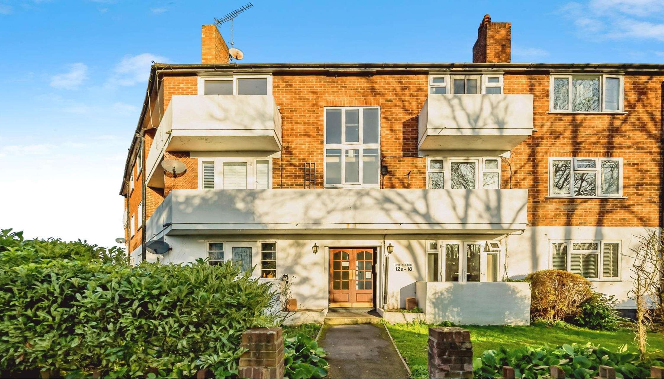
River Court, Taplow Maidenhead SL6 0AU