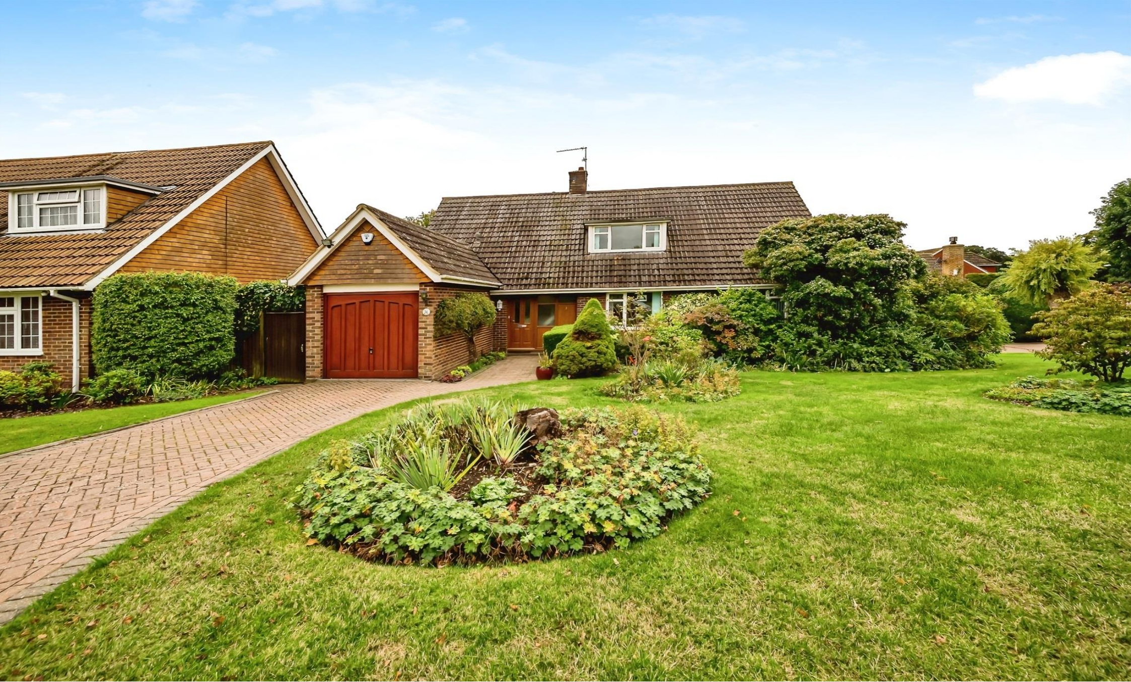
Dove House Crescent, Slough SL2 2PZ