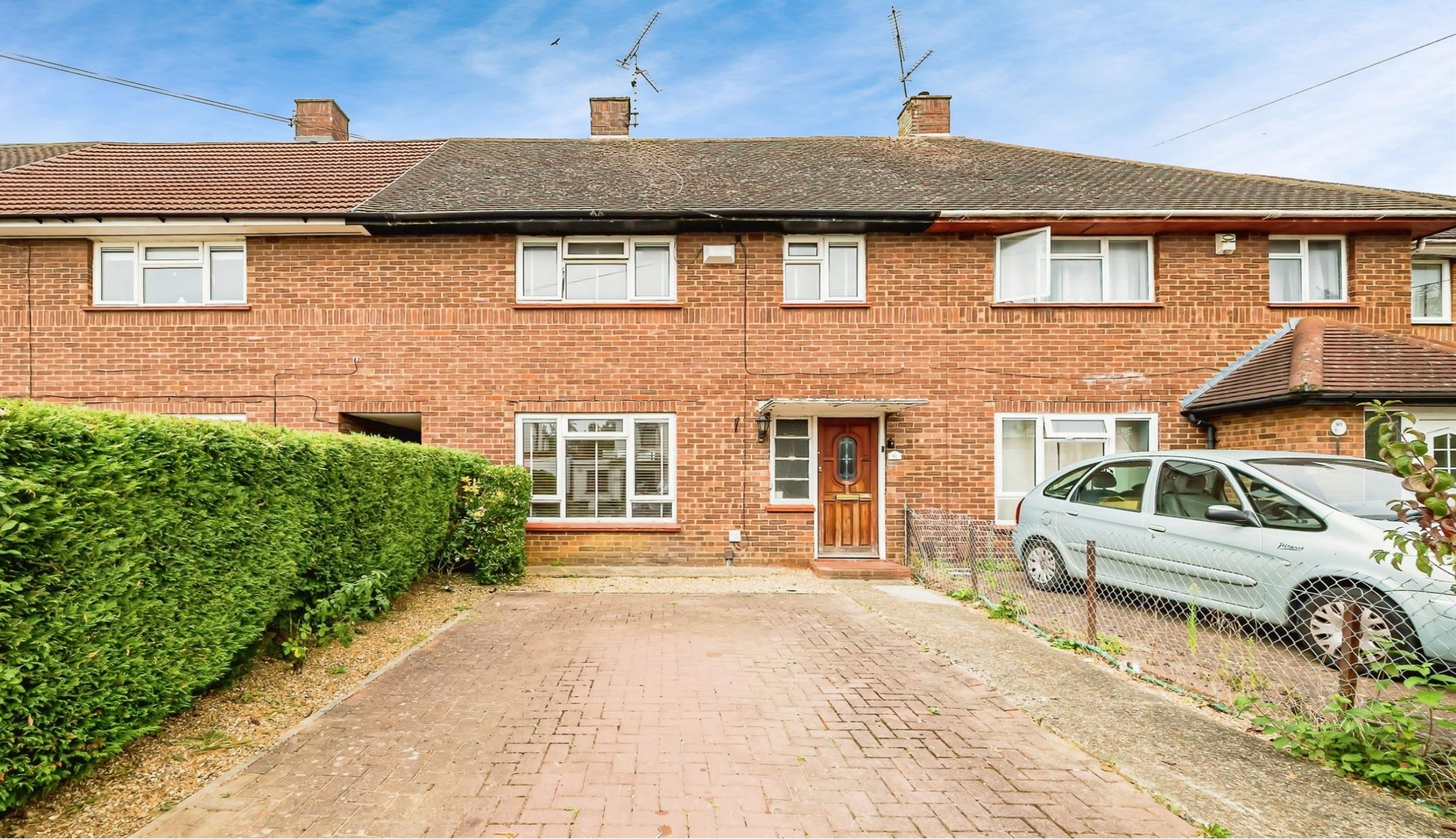
Blumfield Crescent, Slough SL1 6NJ