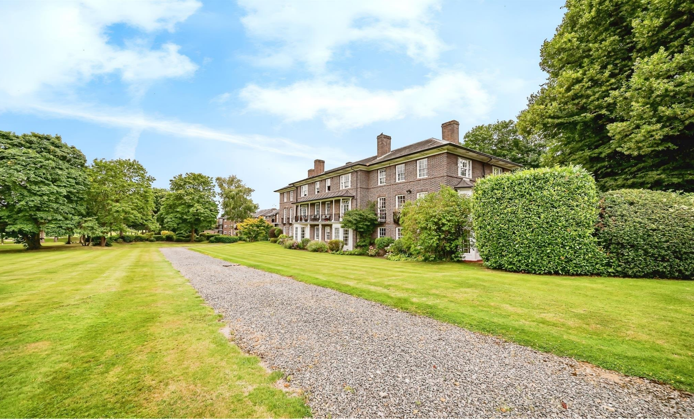
Park Lawn, Farnham Royal Slough SL2 3AP