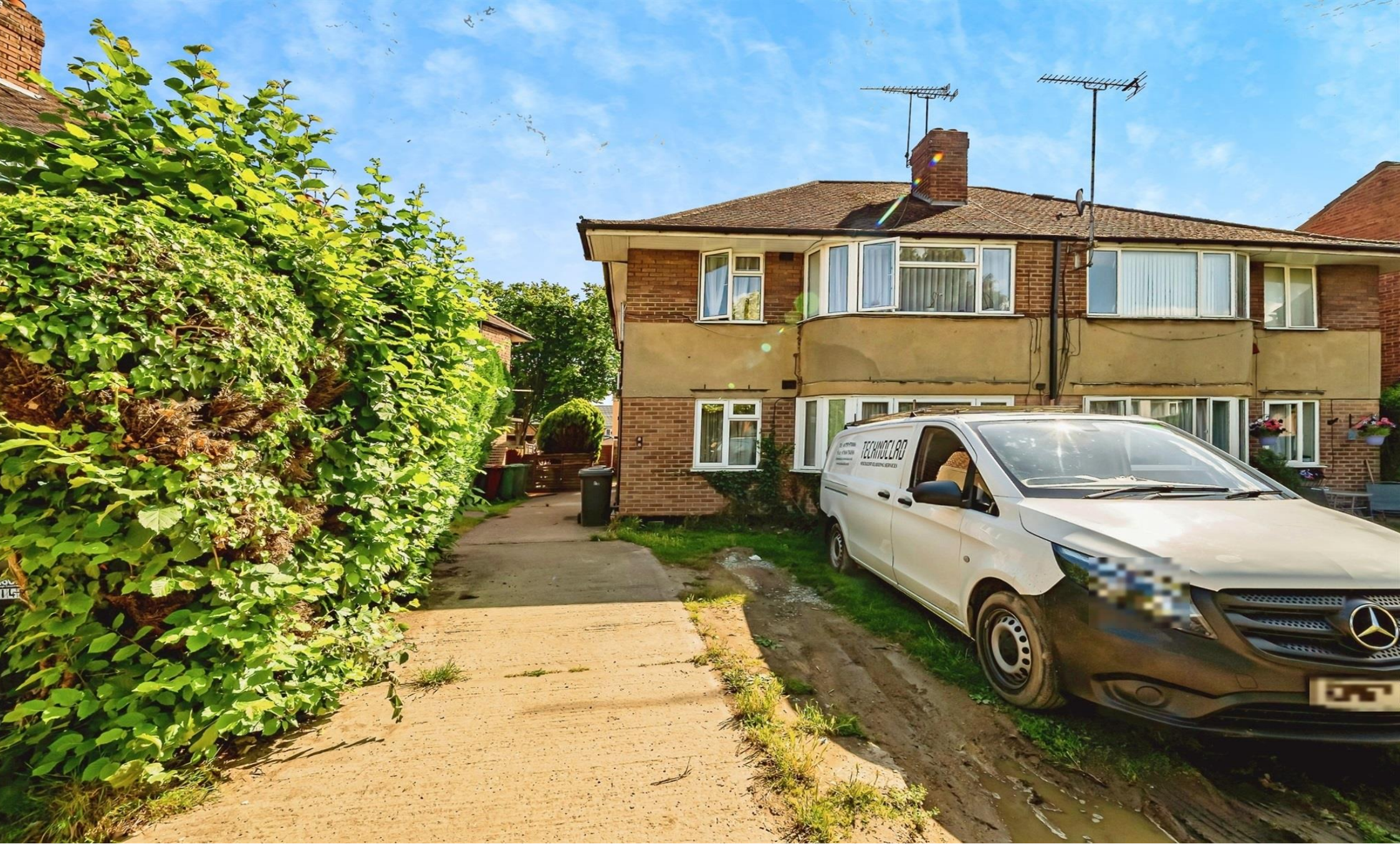
Adelphi Gardens, Slough SL1 2RG