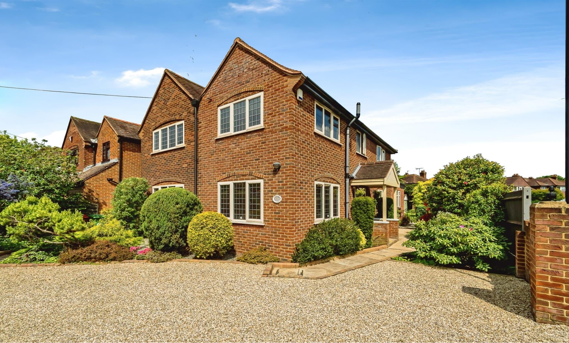
Friary Cottage Burnham Lane, SL1 6LE