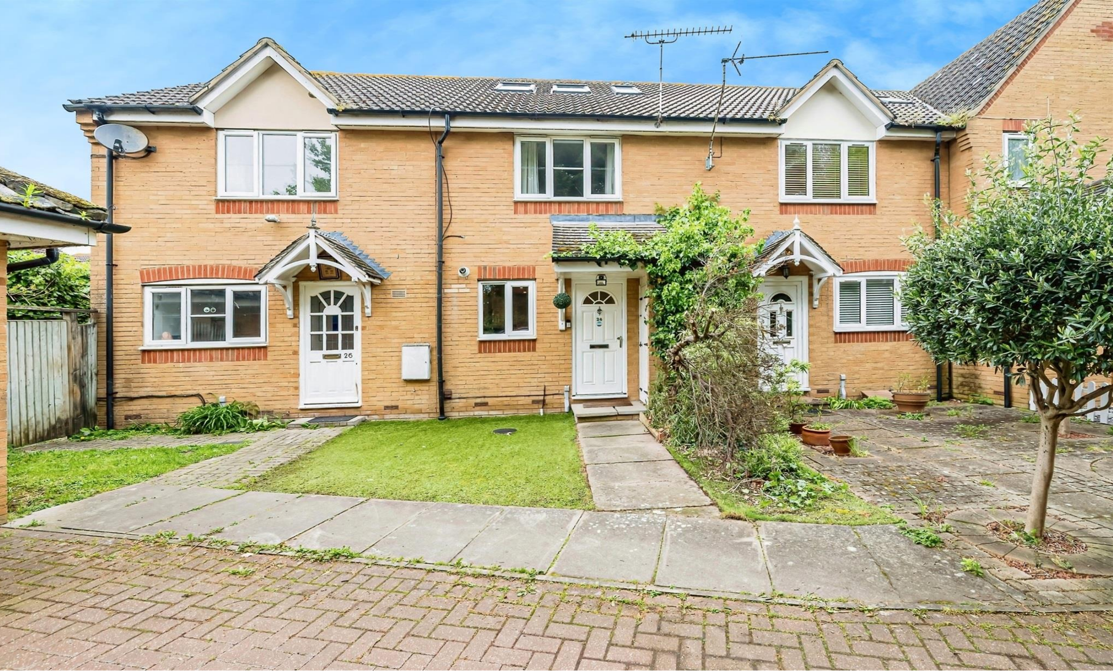
Copse Close, Slough SL1 5DT