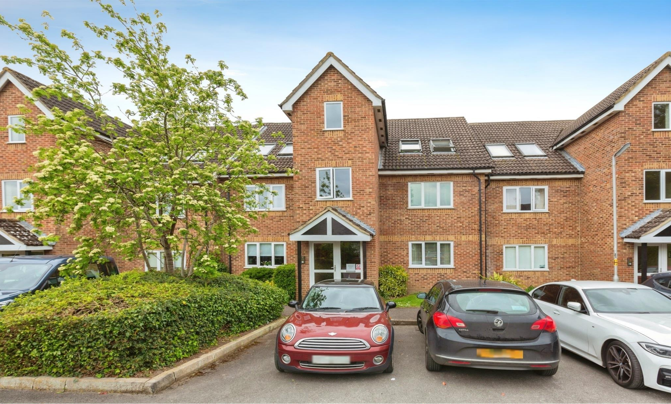
Old Fives Court, Burnham Slough SL1 7ET