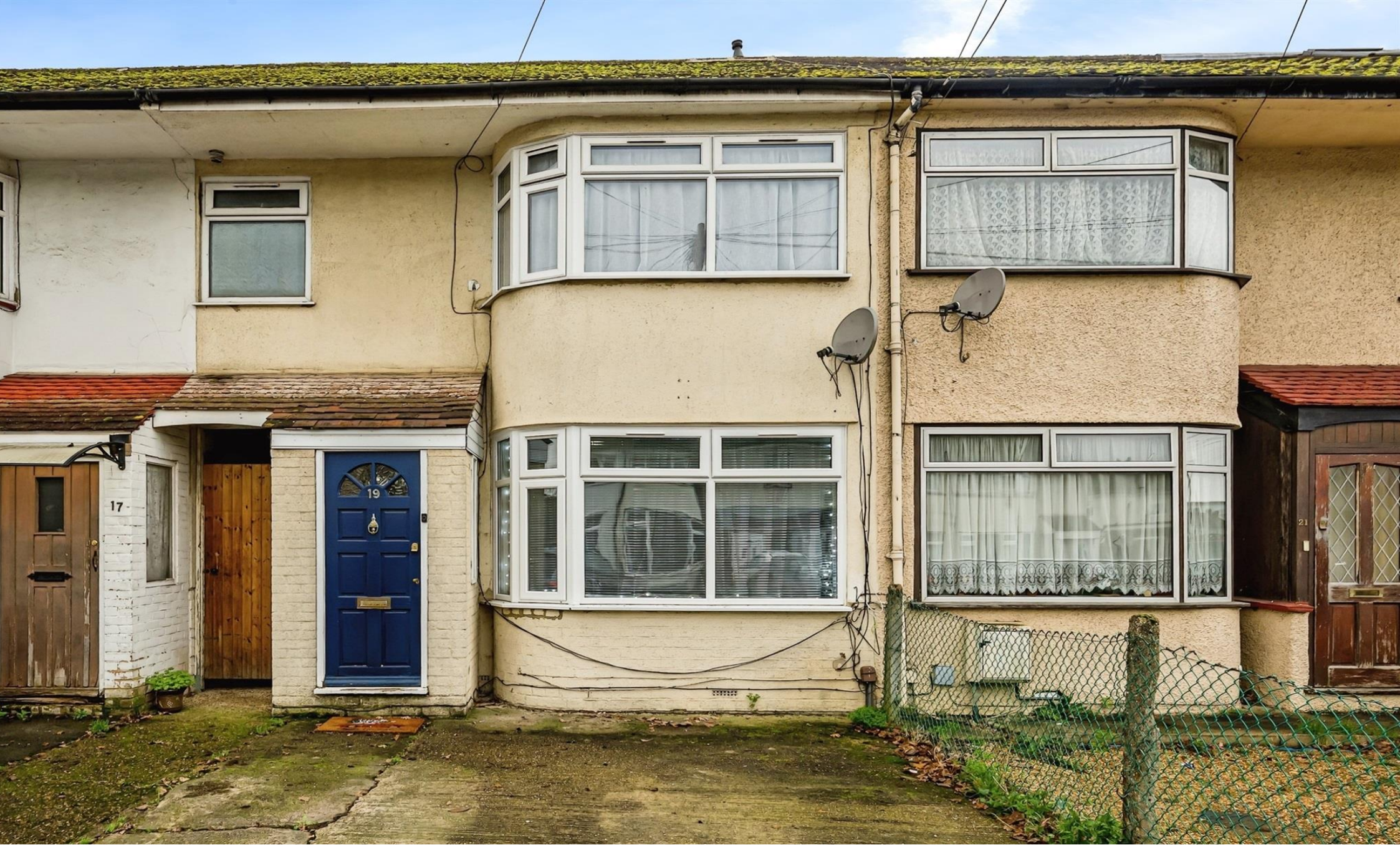
Lewins Way, Slough SL1 5JQ