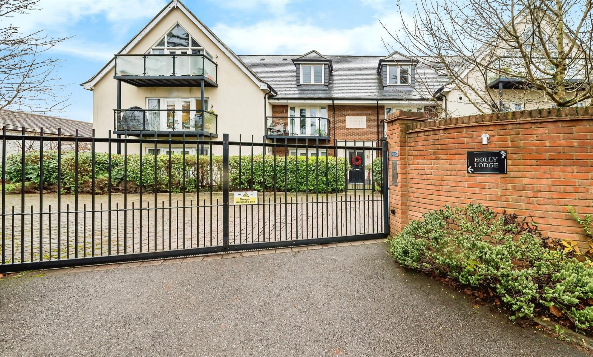
Holly Lodge Windsor Lane, Burnham Village SL1 7DW