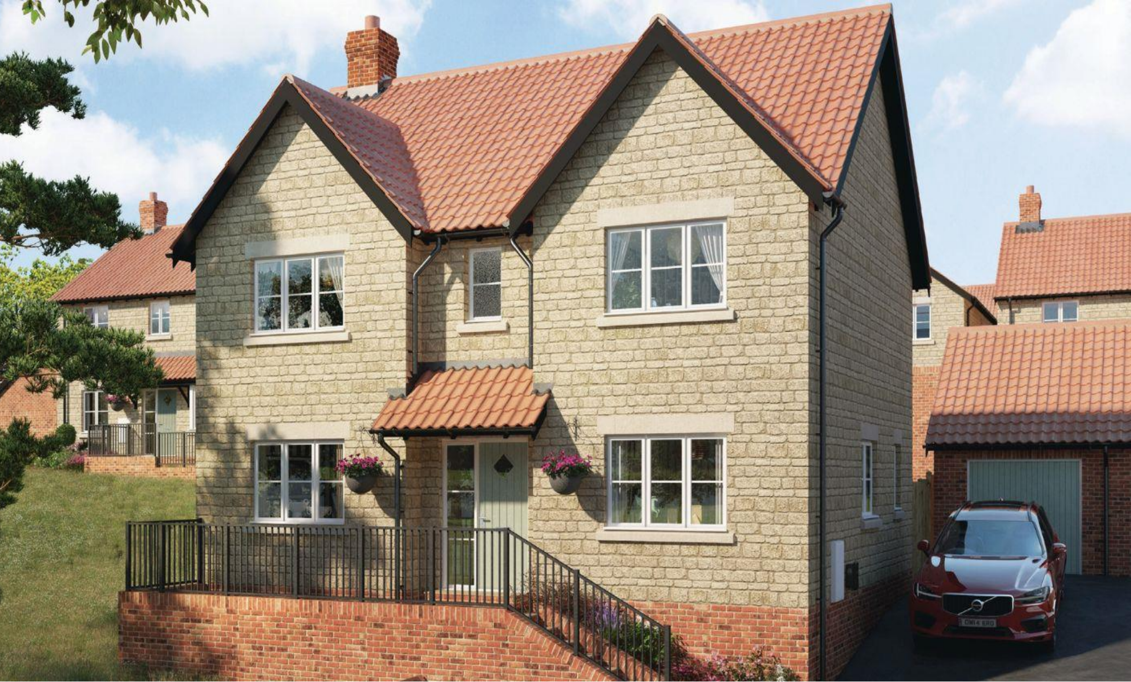
The Dyrham Deluxe Hopton Rise, Malmesbury SN16 0GB