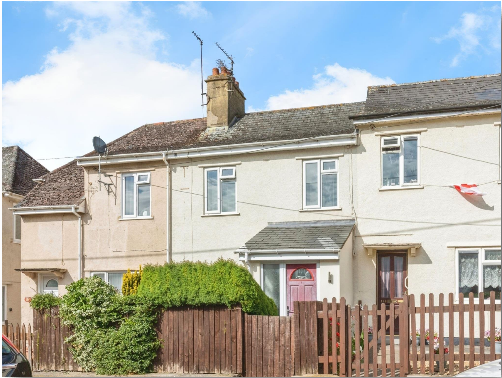
Wood Lane, Chippenham SN15 3EE