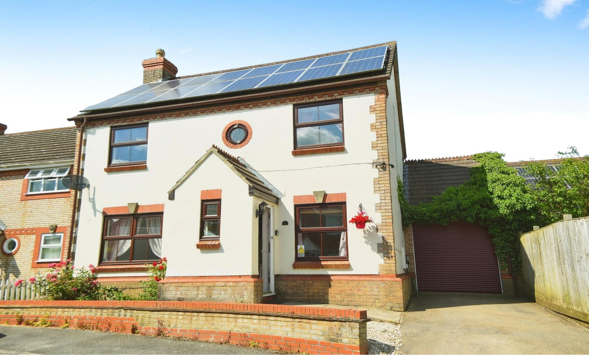
Brewer Mead, Chippenham SN15 3FB