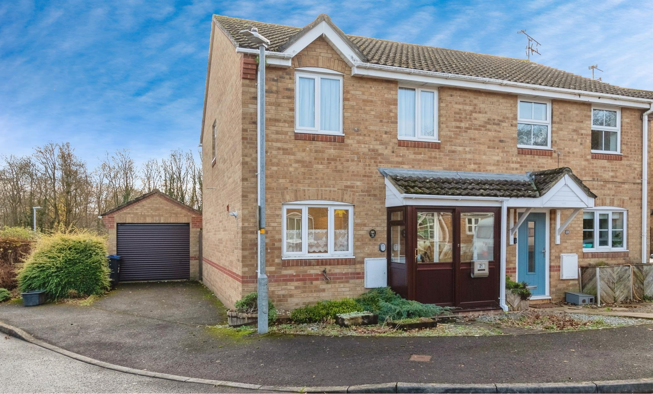
Ascot Close, Chippenham SN14 0SL