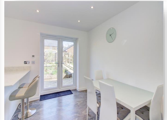
Phillips Grove, Yatton Keynell Chippenham SN14 7FA