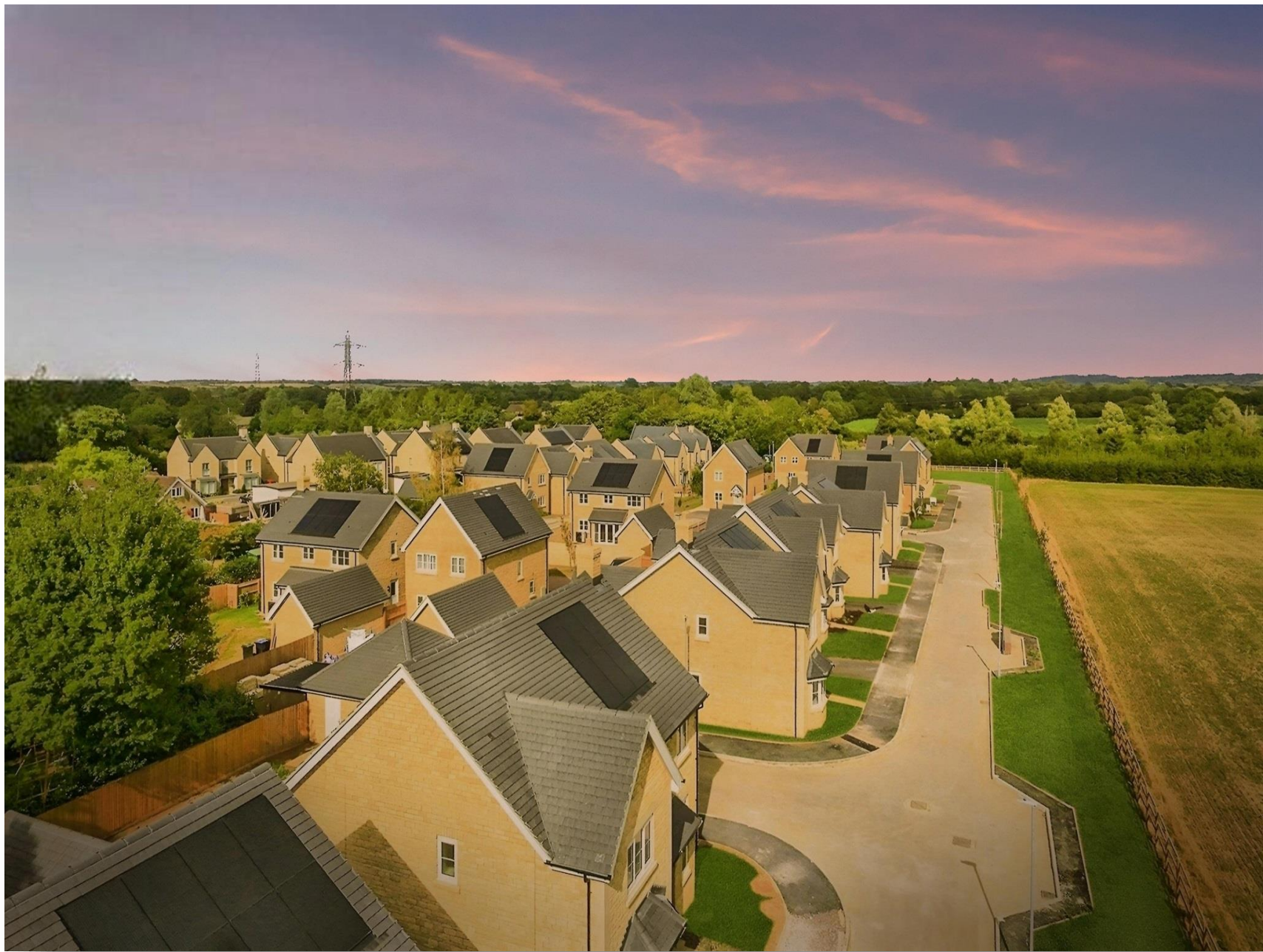
The Cherhill Great Somerford, Great Somerford Chippenham SN15 5FF