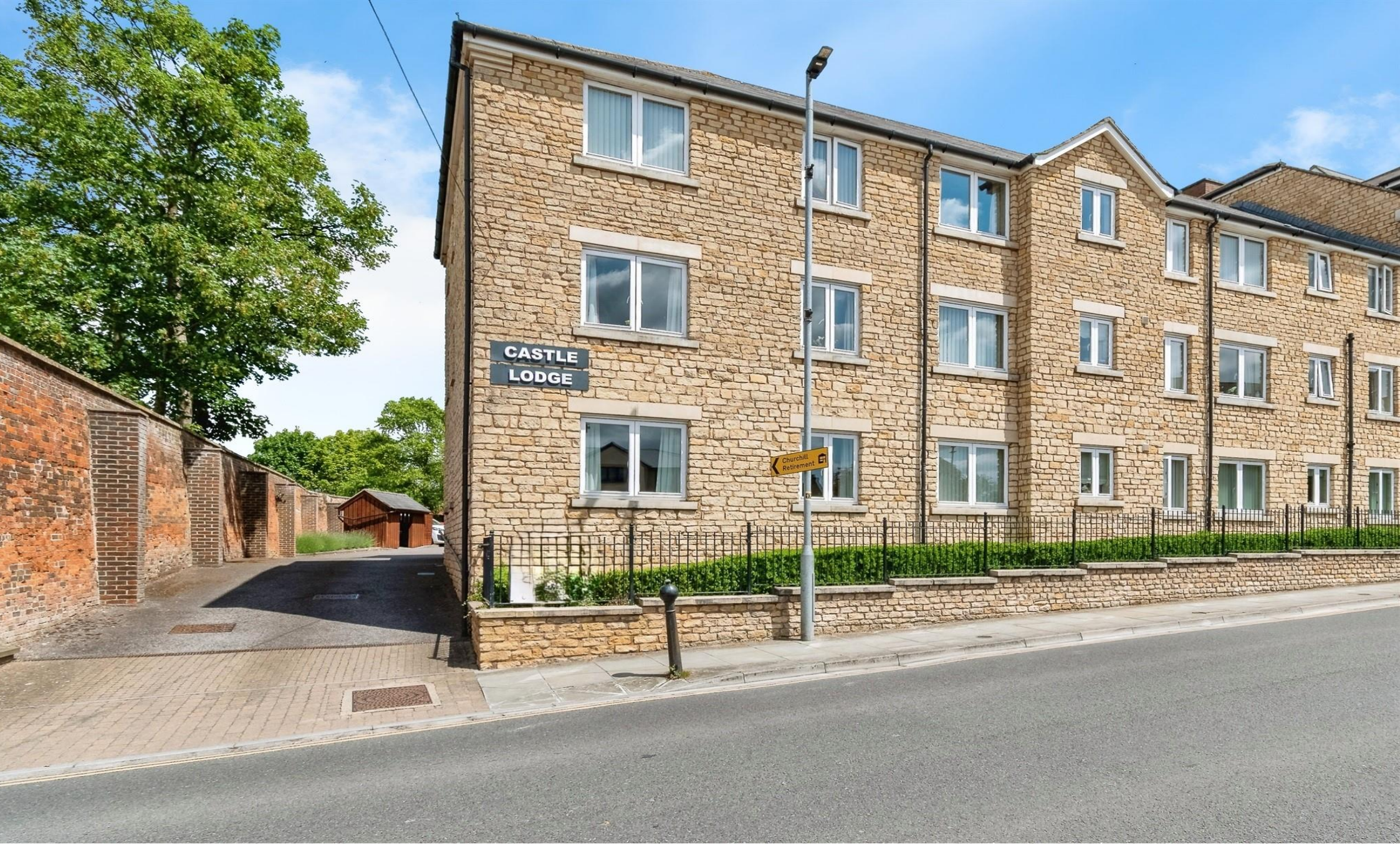
Castle Lodge Gladstone Road, Chippenham SN15 3YY