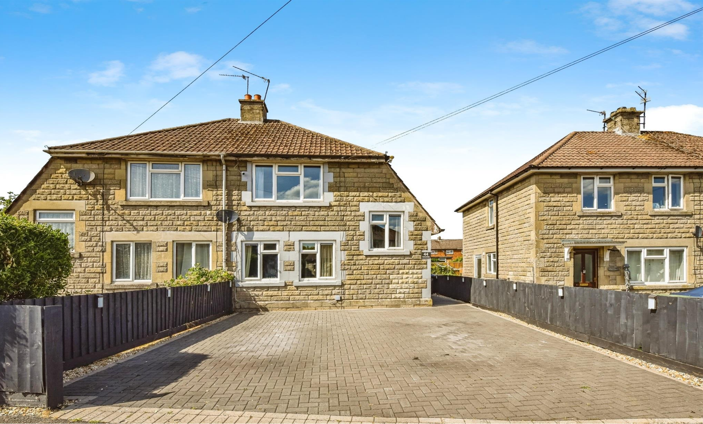
Oaklands, Chippenham SN15 1RD