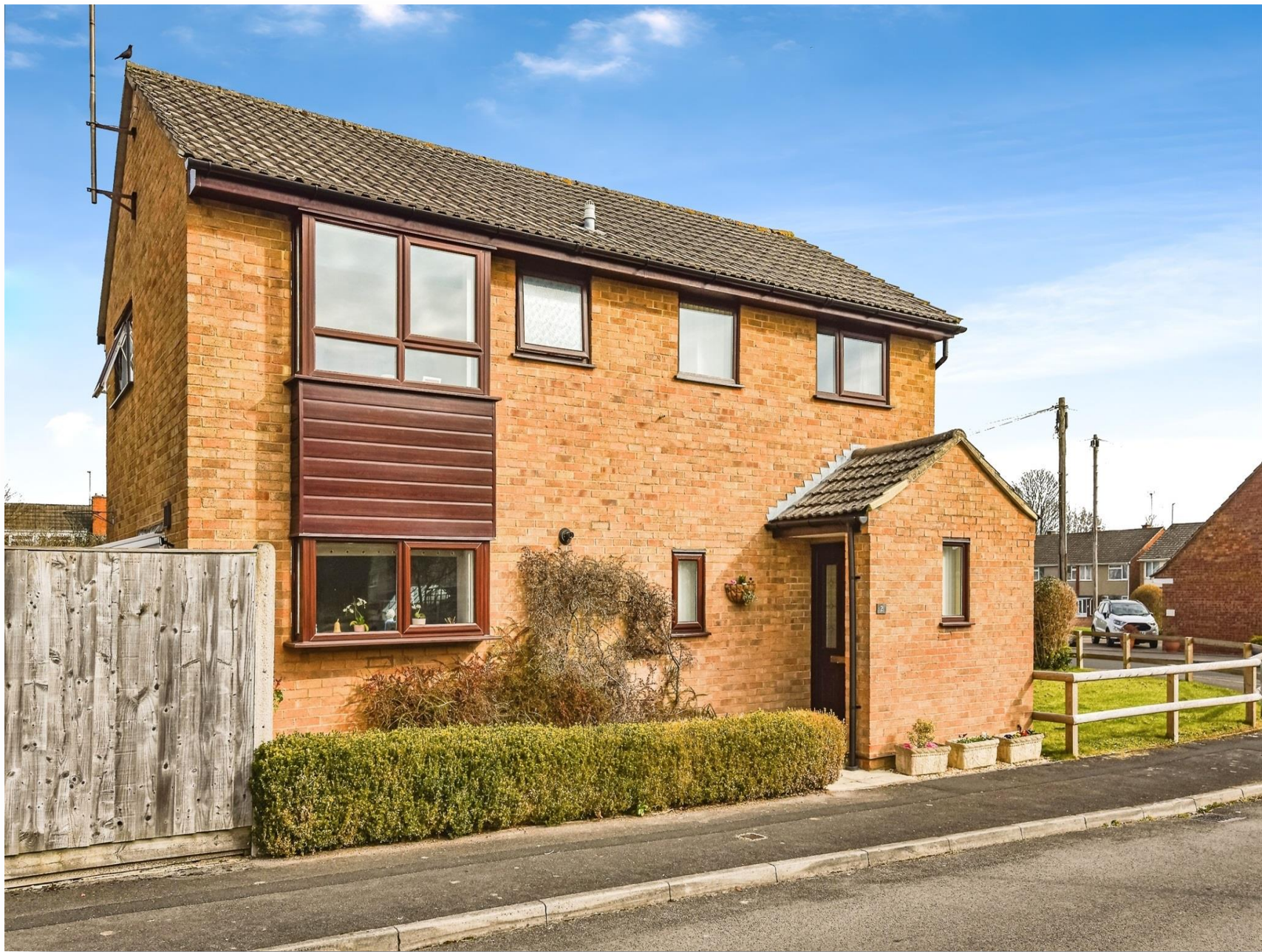
Andrews Close, Chippenham SN14 0TX