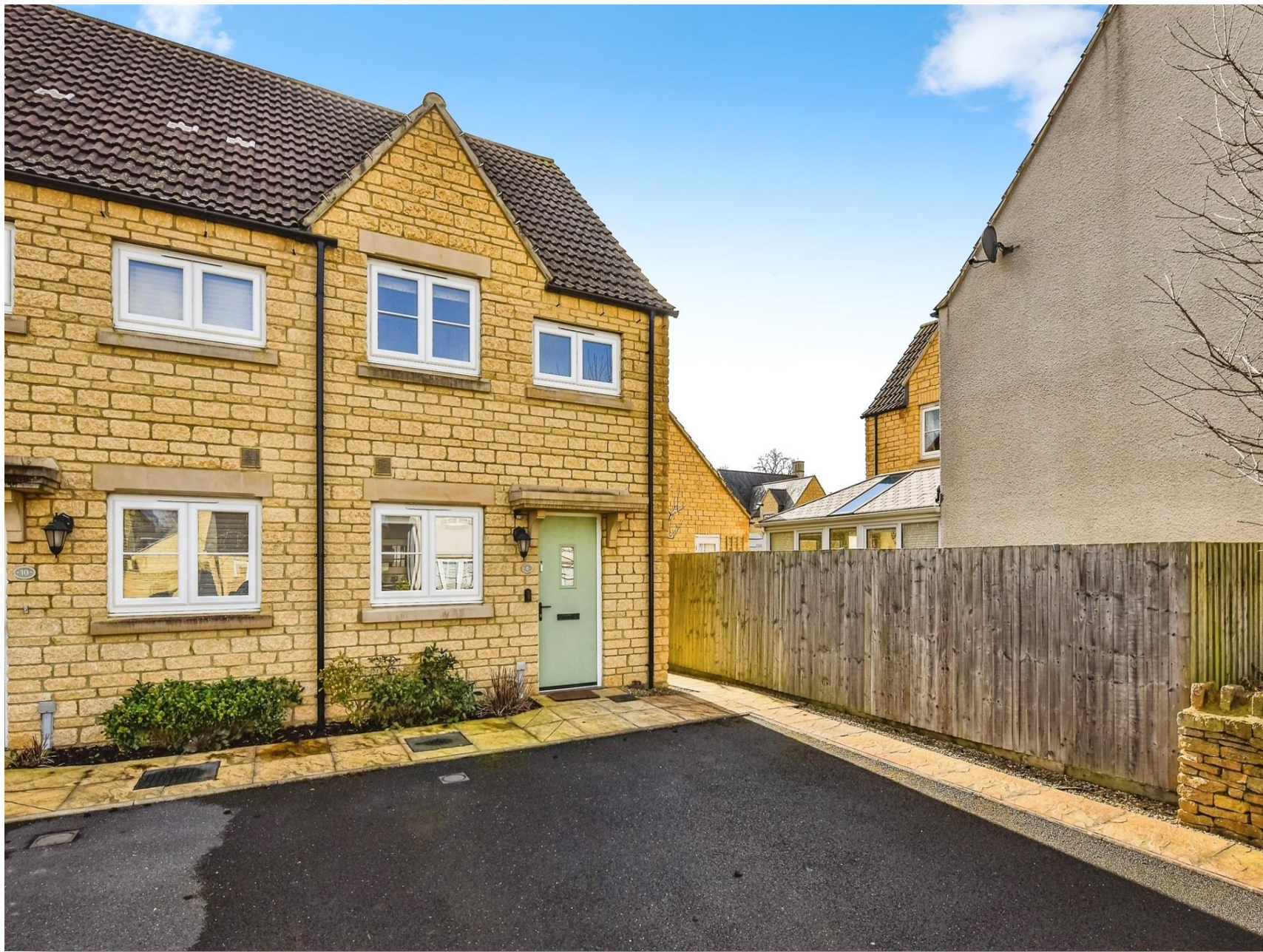
Barrington Court, Sutton Benger Chippenham SN15 4TY