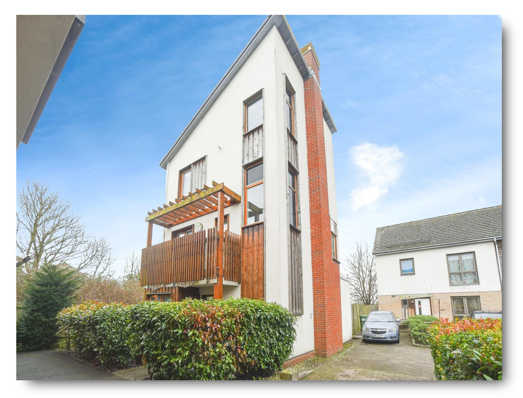
Great Mead, Chippenham SN15 3QJ