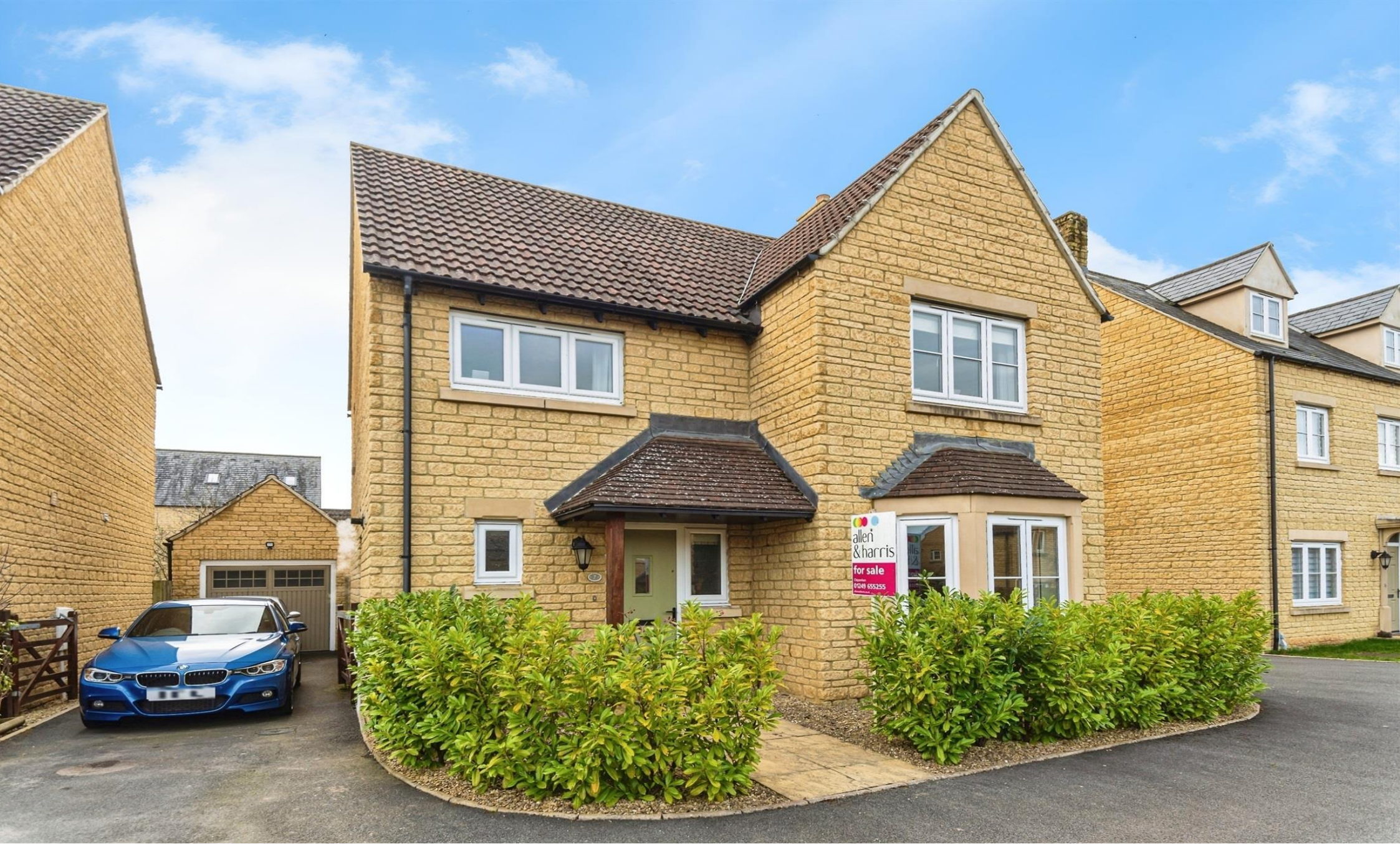
Barrington Court, Sutton Benger Chippenham SN15 4TY