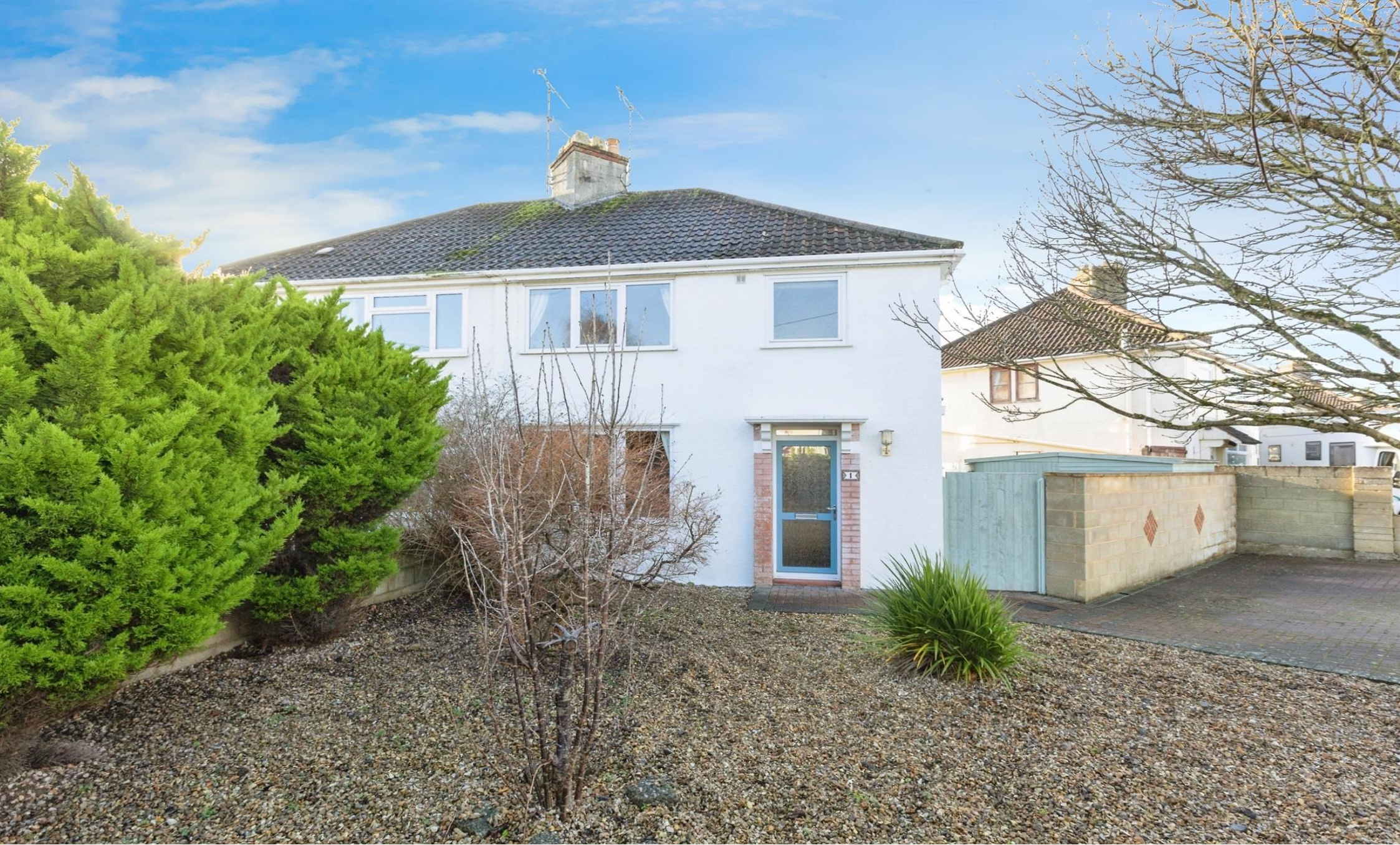
Greenway Gardens, CHIPPENHAM SN15 1AJ