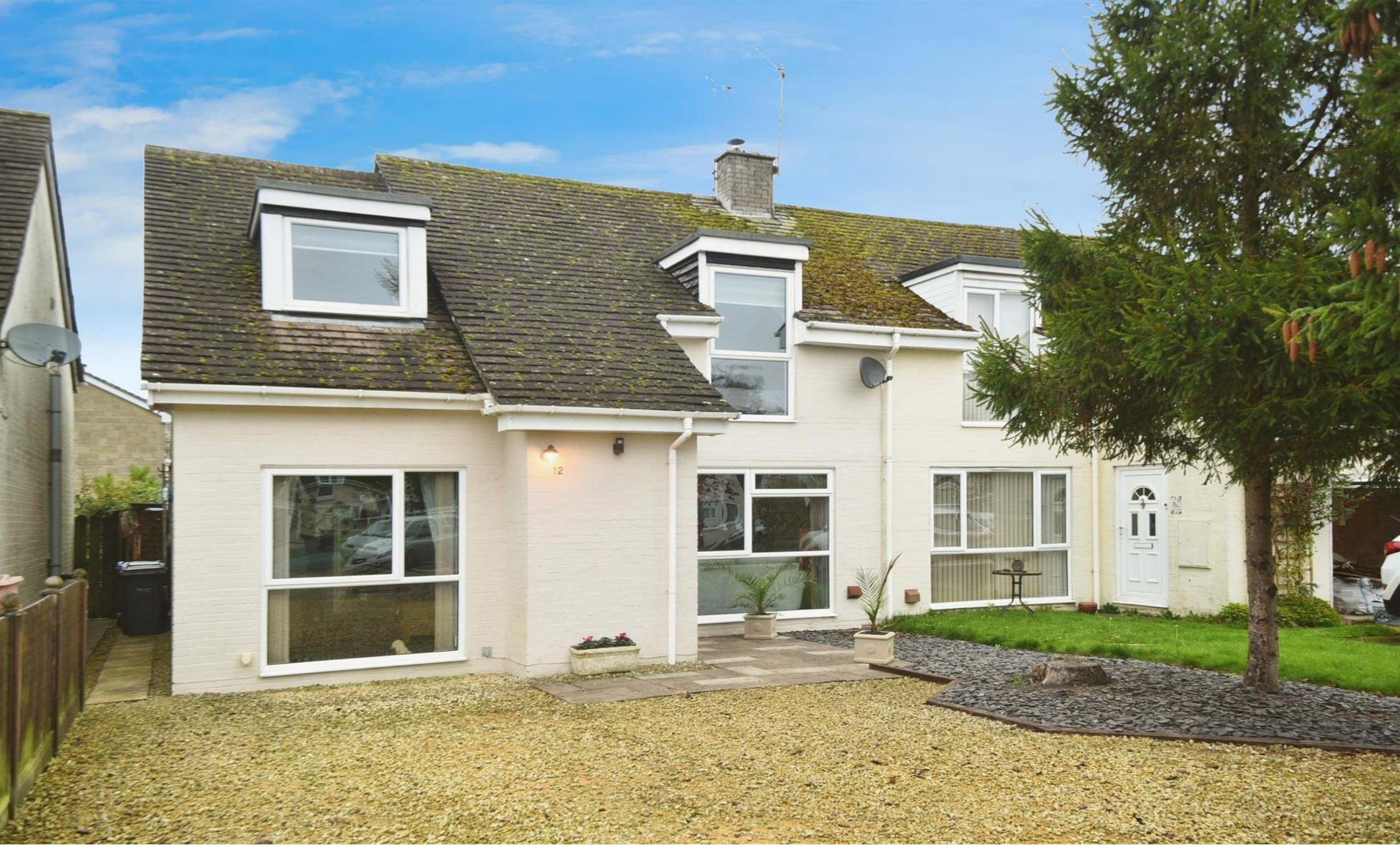
Lee Crescent, Sutton Benger Chippenham SN15 4SE