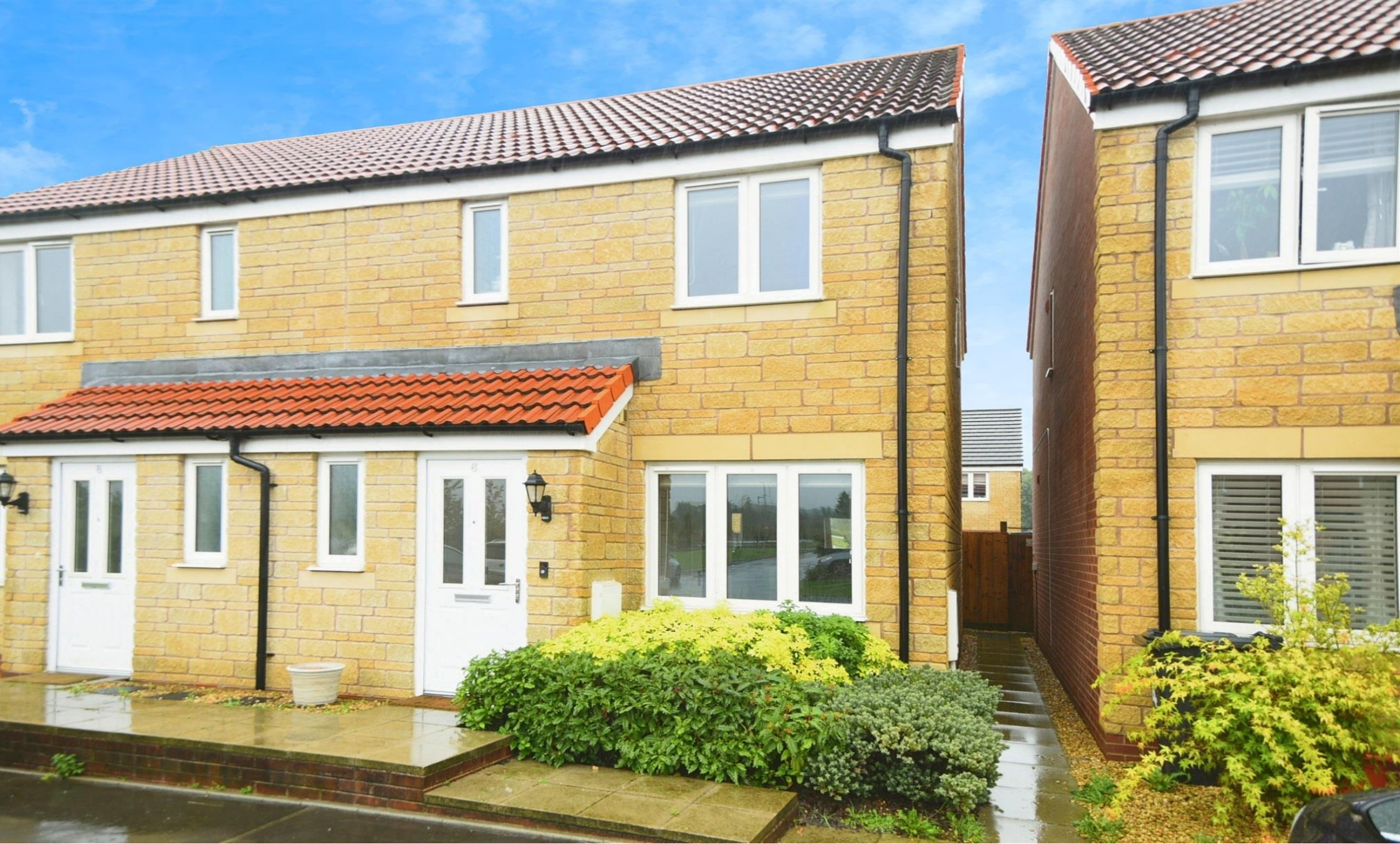
Hazel Crescent, Chippenham, SN15 1FQ