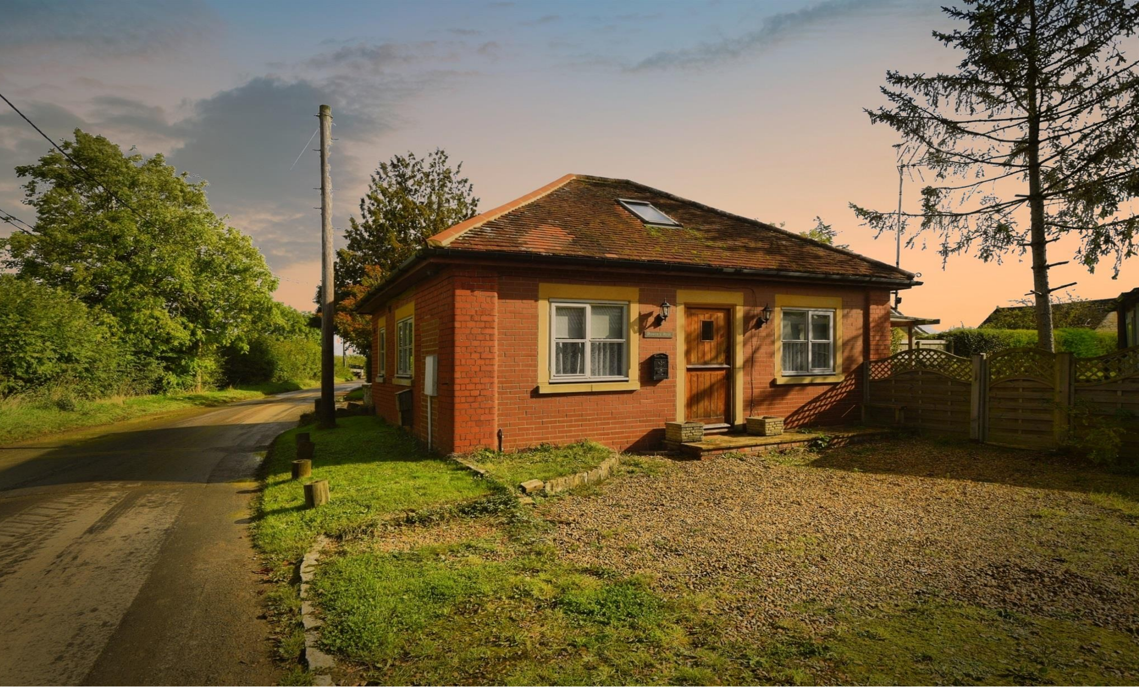
Royces Rest East Tytherton, Chippenham SN15 4LX