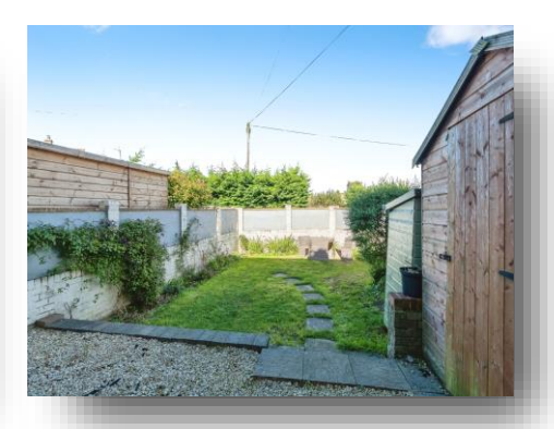
Maranatha House Church John Aubrey Grove Ln