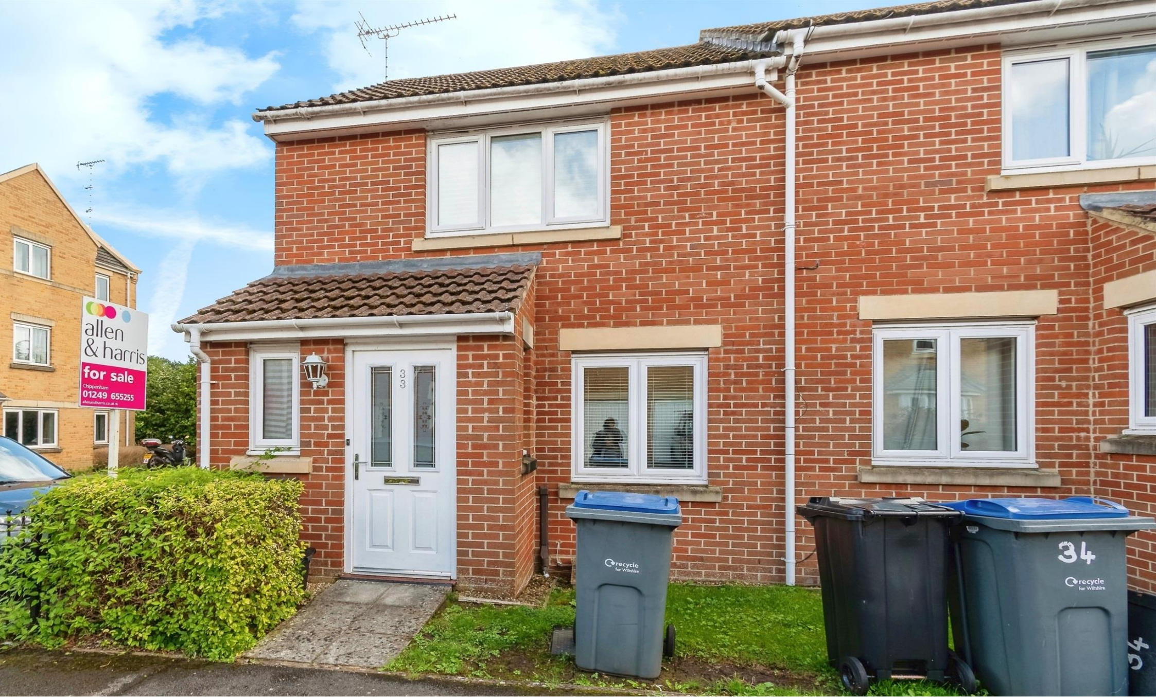
Rudman Park, Chippenham SN15 1NB