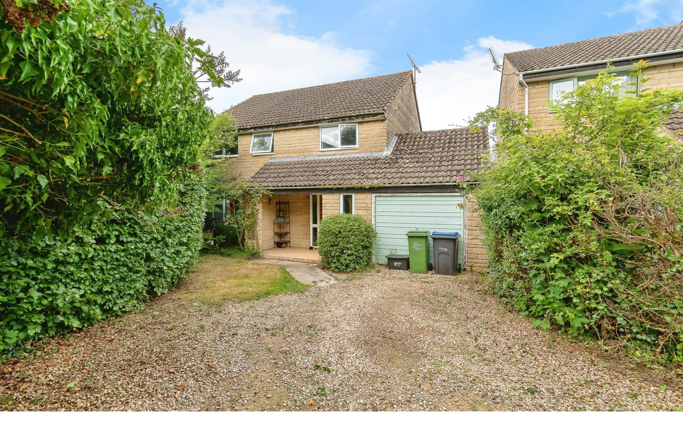
The Close, Kington St. Michael Chippenham SN14 6LE