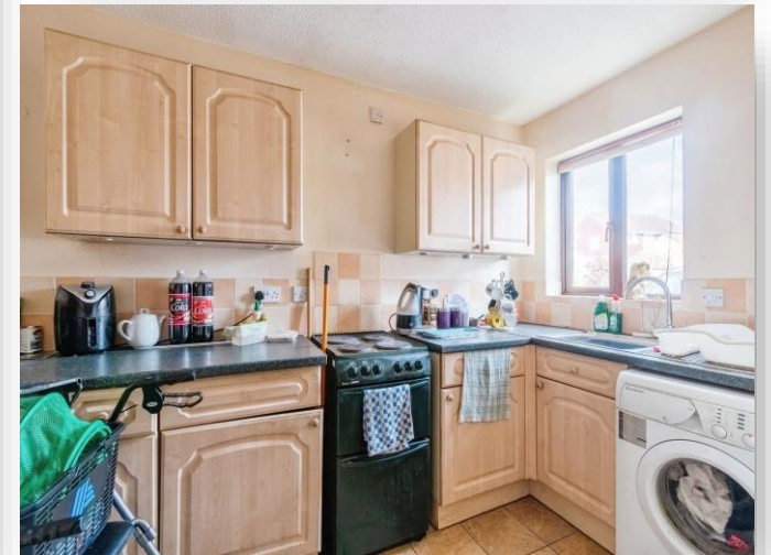
Elizabeth Place, Chippenham SN15 3UP