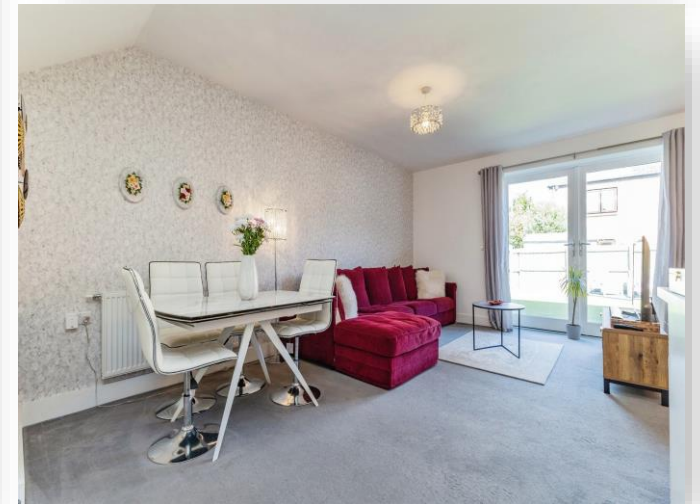
Foston Way, Stockton-On-Tees TS18 2SS