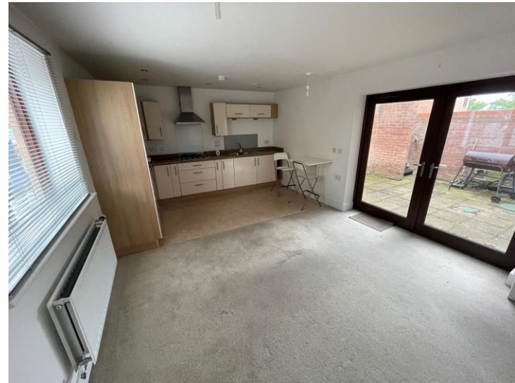
Riverton Croft, Stockton-On-Tees TS18 2ST