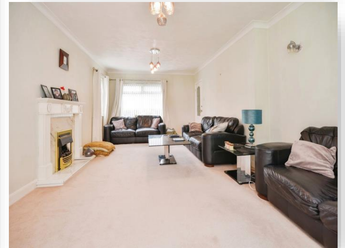
Calcott Close, Stockton-On-Tees TS19 0UB