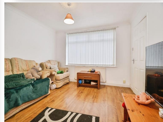
Tithe Barn Road, Stockton-On-Tees TS19 8PR