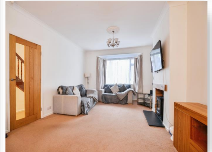
Brompton Grove, Stockton-On-Tees TS18 5HF